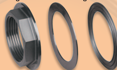
Back Nut Left Hand Thread - SN(LH)