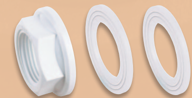
Back Nut White SBN(W)