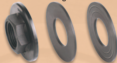
Large Back Nut SBNL