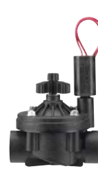
ICV-101G Inlet diameter: 1" (25 mm) Height: 14 cm Length: 12 cm Width: 10 cm