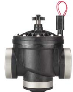
ICV-301 Inlet diameter: 3" (80 mm) Height: 27 cm Length: 22 cm Width: 19 cm