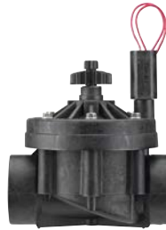
ICV-201G Inlet diameter: 2" (50 mm) Height: 18 cm Length: 17 cm Width: 14 cm