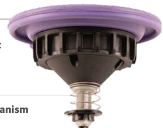
Filter Sentry Mechanism