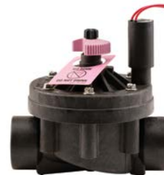
ICV-R Inlet diameter: 1" (25 mm), 1½" (40 mm), 2" (50 mm), and 3" (80 mm) Height: 18 cm Length: 17 cm Width: 14 cm