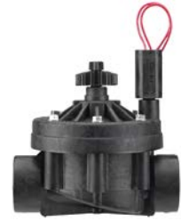
ICV-151G Inlet diameter: 1½" (40 mm) Height: 18 cm Length: 17 cm Width: 14 cm